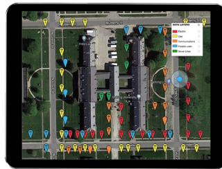
A screen capture from the asset location map in the InfraMarker app, used for the installation of RFID Markers in 2015.