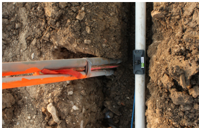
InfraMarker underground tag placed in trench over water pipe