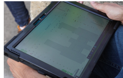
All Utilities depicted in InfraMarker software after installation in 2015