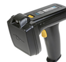
TSL 1128 Bluetooth® UHF RFID Reader

The TSL 1128 mobile RFID interrogator was used to write and read the underground markers. The TSL 1128 was selected for its RFID antenna performance, ease of use in the field, and connectivity to the mobile device running the data collection apps.