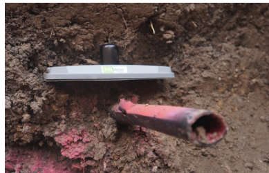
InfraMarker underground tag placed over water pipe near a catch basin